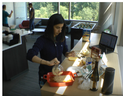
Figure 3: Experimental participant preparing a recipe with assistance from the AskChef system. The smart speaker and the laptop are clearly visible on the right of the image.

The average time taken to prepare a recipe was 30 minutes. Two participants made Chicken Taco, three made Cinnamon Muffin, one made Rissoto and two made Tiramisu. Total number of turns exchanged between the system was 288 turns. Average number of turns per interaction was 36 turns.