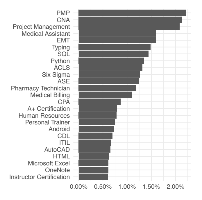
Figure 1: Top 25 most searched skills in our data.