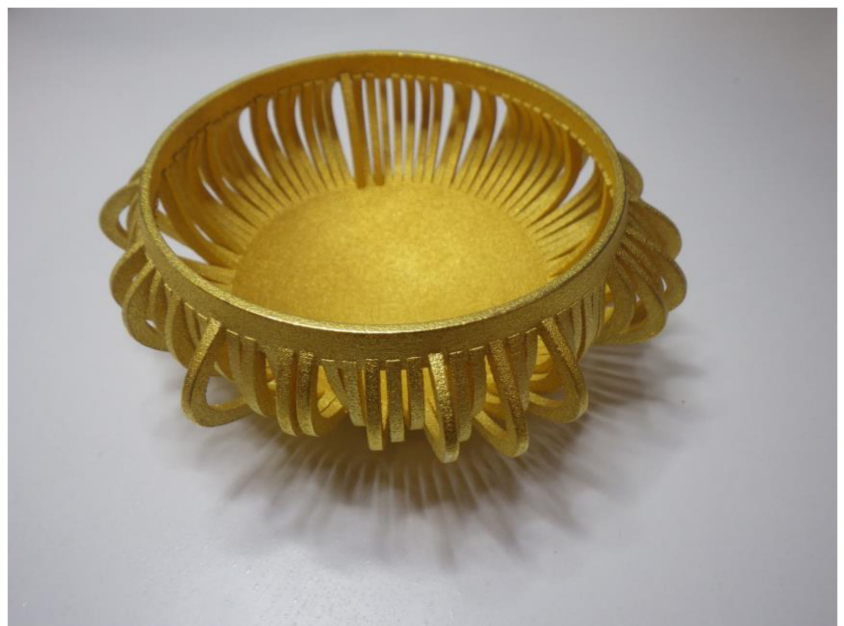
Figure 3. Chemo singing bowl. 1

As computers have entered domestic spaces, the field of HCI has evolved from focusing on effectiveness and efficiency toward “user experience”