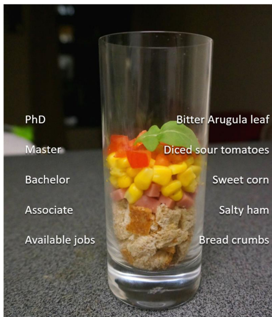
Figure 4. Salad cup to encode the number of annual STEM degree earners and STEM job openings. 24

(UX). Concepts such as joy of use, aesthetics, and hedonic qualities of interaction have become more important. The field has realized that experience is a key when designing technology for personal purposes (e.g., entertainment, social engagement, health tracking or even prayer). This shift is reflected in the professional make-up of the field; since the 2000s, a strong influx of designers has led to a new research focus on “interaction design.”