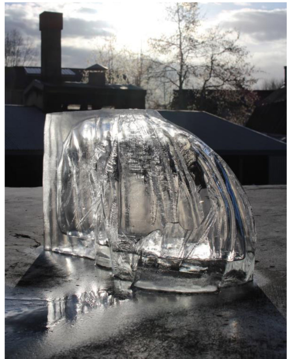
Figure 2. Grewingk Glacier. (Adrien Segal, 2015.)

What value do physicalizations, like the ones above, provide that we are currently missing in our conception of the value of visualization more broadly? To begin to answer this question, we turn to expertise from a variety of disciplines.