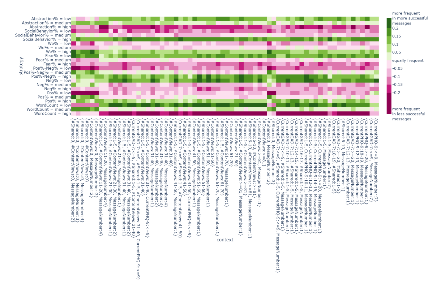
Figure 3: The salience of the most interesting <multidimensional context (A) \rightarrow strategy (B)> patterns are visualized. Each cell represents the salience of a pattern A \rightarrow B . Context A is on the X-axis while strategy B is on the Y-axis. Salience is the difference between percentages of rules containing B given A across the two clusters, and is multiplied by "-1" when the rule occurs more frequently in less successful messages. Thus, rules in green occur more frequently in more successful messages while rules in pink occur more frequently in less successful messages. Darker colors imply greater salience. For readability, the contexts are sorted on ContentViews followed by Shared and then MessageNumber . The figure is best read strategy -wise from left to right.

greater outcomes; whilst more engaged clients appear to benefit more from messages with less negative words, less abstraction, and more references to social behaviors.