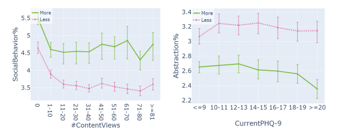
Figure 2: Mean percentage of words in 'more' and 'less' successful support messages that are associated with: SocialBehavior across each bin of the ContentViews context variable (left); and Abstraction across each bin of the CurrentPHQ – 9 context variable (right).

Figure 2 (right) further shows how 'more' successful messages contained on average less words associated with the strategy variable Abstraction than 'less' successful messages; and this finding was consistent independent, e.g. , of the clients' depressive symptoms prior to the supporter review ( cf. the bins of the CurrentPHQ – 9 variable). Frequently used abstraction words were: think/thought, know, understand , and learn .