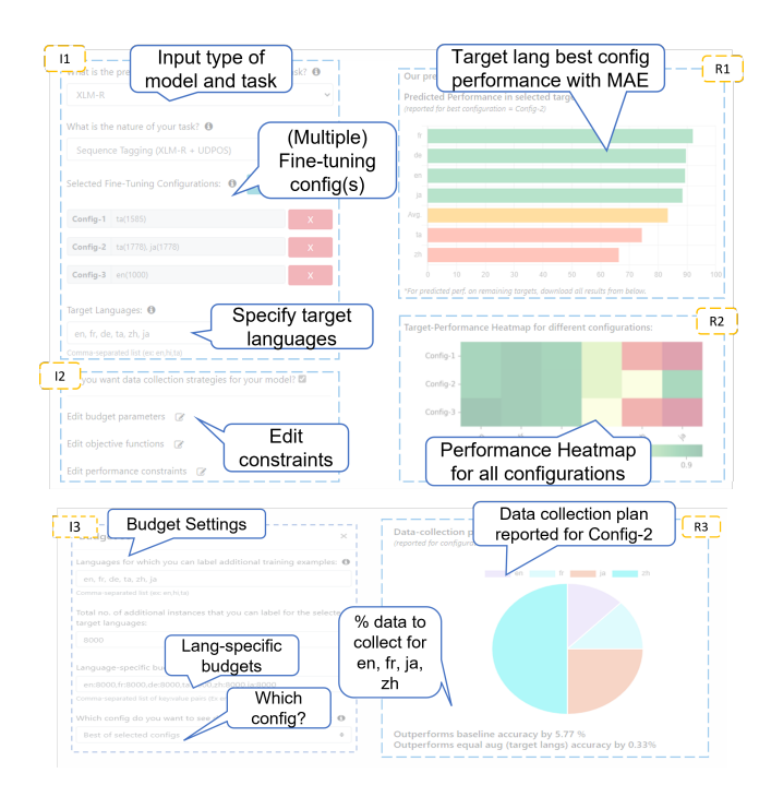
Figure 1: LITMUS interface (some panels omitted).

collected, language-specific budget caps, \{b_j\} , and the base configuration C^* for which a data labeling plan is required (I2 in Fig. 1). The data labeling plan can be customized for different maximizing objectives such as weighted average or minimum³ performance across the targets, subjected to different constraints (such as target-specific or overall minimum or average performance). Based on these parameters, the tool suggests an optimal allocation, d_j^A , of the budget for language l_j^A (Fig. 1, presented as a pie-chart) along with the expected improvement in performance.