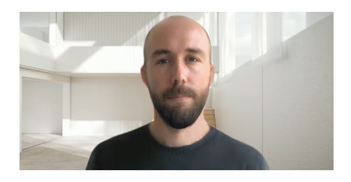
Figure 7: An avatar with high visual fidelity.

A participant represented by a more realistic avatar was easier to identify, accepted by the other participants, and regarded as more reliable. However, study participants that sought privacy through avatars felt exposed by using realistic avatars. While it was harder to distinguish low-fidelity avatars from each other, offering personalization for such avatars could aid in differentiating between participants while retaining user privacy.