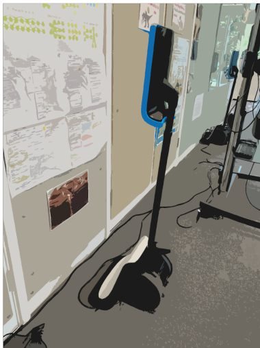
Figure 1: A Double 3 MRP robot parked in its dock

The lab purchased five Double 3 MRP robots [23], with the intention of having one for each floor of its building. The robots consist of a 9.7 inch touch screen, equipped with a microphone, camera and speakers, attached on a pole (of remotely adjustable height) which is then attached on a gyroscopically-stabilised two-wheeled base. Each robot comes with a docking station, which is plugged into an electrical socket and allows a docked robot to charge (figure 1).