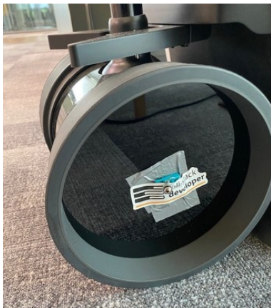
Figure 2: Cat bells were attached to the robots' wheels

of the sound, she was able hear it and know when a robot was in use near her. Moreover, sighted, on-site users have found it useful to be able to hear when a robot is approaching, as they had also previously found the stealthy movement of the robot unsettling. We did not have the opportunity to assess accessibility for other needs.