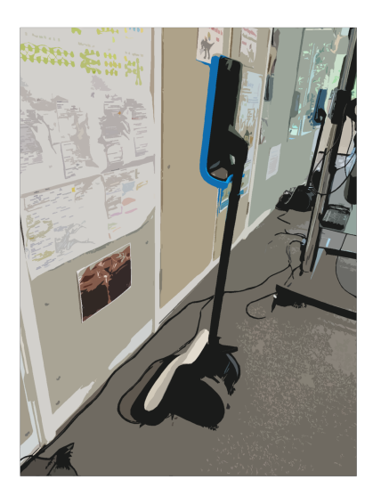
Figure 1: A Double 3 MRP robot parked in its dock

The lab purchased five Double 3 MRP robots [23], with the intention of having one for each floor of its building. The robots consist of a 9.7 inch touch screen, equipped with a microphone, camera and speakers, attached on a pole (of remotely adjustable height) which is then attached on a gyroscopically-stabilised two-wheeled base. Each robot comes with a docking station, which is plugged into an electrical socket and allows a docked robot to charge (figure 1).