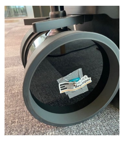
Figure 2: Cat bells were attached to the robots' wheels

of the sound, she was able hear it and know when a robot was in use near her. Moreover, sighted, on-site users have found it useful to be able to hear when a robot is approaching, as they had also previously found the stealthy movement of the robot unsettling. We did not have the opportunity to assess accessibility for other needs.