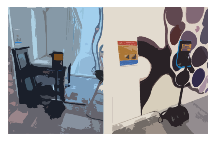
Figure 4: Robot docking locations in different areas of the building

There were not many places in the lab's building to satisfy all these requirements. Most areas that were away from desks were fire exit pathways which could not be blocked. In non-pathway common areas, such as collaboration spaces and kitchens, there were not always sockets behind walls and using a nearby floor socket would lead in exposed cables causing a tripping hazard. There also were not many empty walls against which a robot could stand without being awkwardly placed between furniture and other equipment. In some cases, we had to make compromises with regards to ideal placement, prioritizing safety over convenience (Figure 4).