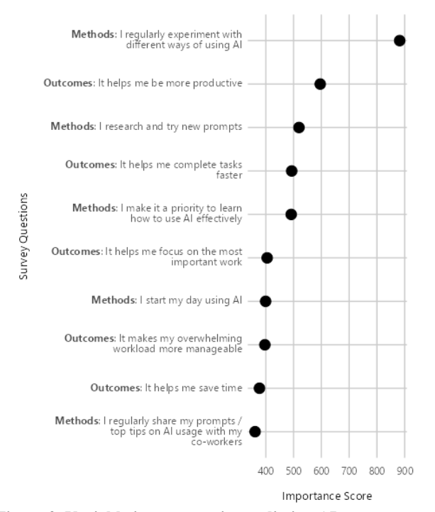
Figure 2. Variable importance in predicting AI power usage

between February 15, 2024, and March 28, 2024. The survey aimed to capture user sentiments and experiences with generative AI broadly as opposed to focusing on any specific generative AI tool such as Copilot.