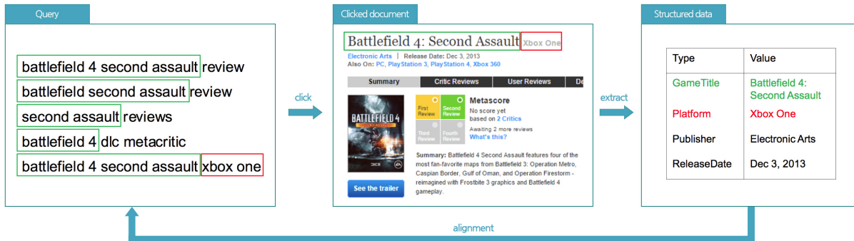
Figure 3: An example illustrating annotation projection via click-log and wrapper induction.

tem is typically much lower than the annotation cost of queries.