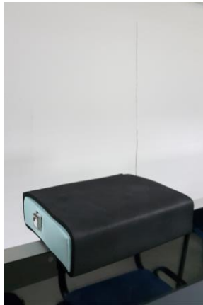
Figure 1. Sensor node prototype

Indoor localization is a difficult and tedious task. It is no wonder systems which attempt to produce accurate measurements of the position of a target tend to make use of complicated techniques and infrastructures.