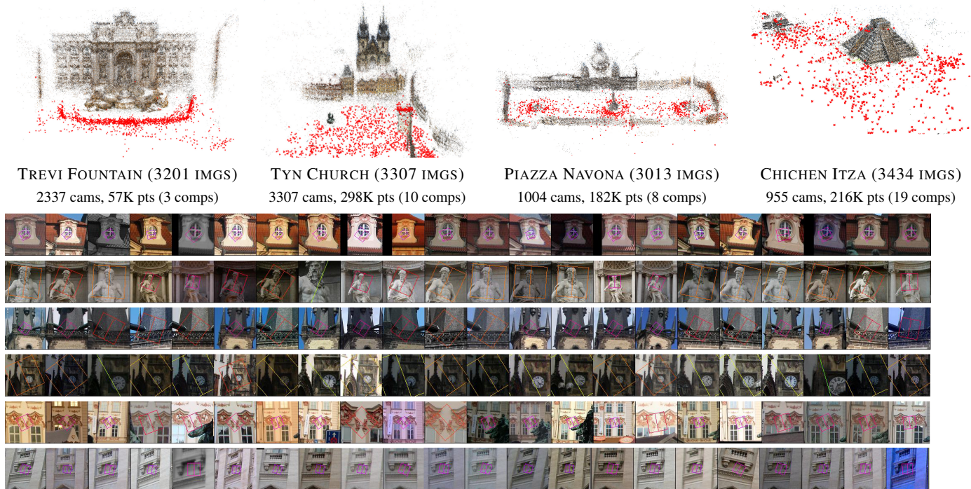
Figure 1: [TOP]: Examples of SfM reconstructions from LANDMARK-620 our Internet photo collection dataset (the largest component is shown and the number of cameras and 3D points are listed). [BOTTOM]: Six out of approx. 8 million tracks i.e. sets of matching keypoints recovered from running SfM on LANDMARK-620 (patches are visualized at their original scales).

motion [29], we construct a database of millions of feature descriptors with automatically-established scene correspondences, i.e. , we know which descriptors (from different images) correspond to the same 3D scene point, with geometric consistency guaranteed.