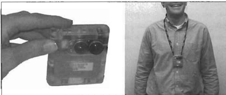
Figure 6.3.2 – The SenseCam v2.3 prototype is shown as a stand-alone and as typically worn by a user. The model pictured here has a clear plastic case that reveals some of the internal components.

In our current design, users typically wear the camera on a cord around their neck, although it would also be possible to clip it to pockets or on belts, or to attach it directly to clothing (see Figure 6.3.2). One advantage of using a neck-cord to wear the camera is that it is reasonably stable when being worn—it tends not to move around from left to right when the wearer is walking or sitting—but at the same time it is relatively comfortable to wear and it is easy to put on and take off. Also, when worn around the neck, SenseCam is reasonably close to the wearer's line of sight, and so generates images taken from the wearer's point of