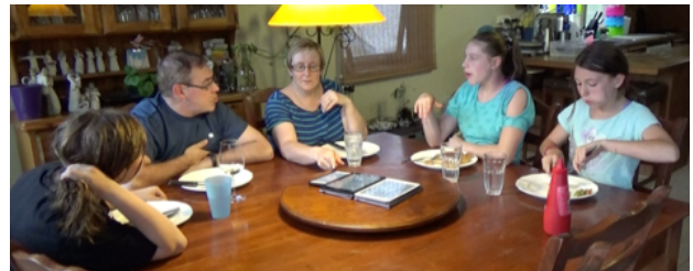
Figure 1: Chorus enables sharing contents through family members’ devices and bring them together by creating a single display, thereby symbolizing the communal aspects of commensality (published with permission).

DOI: http://dx.doi.org/10.1145/3025453.3025492