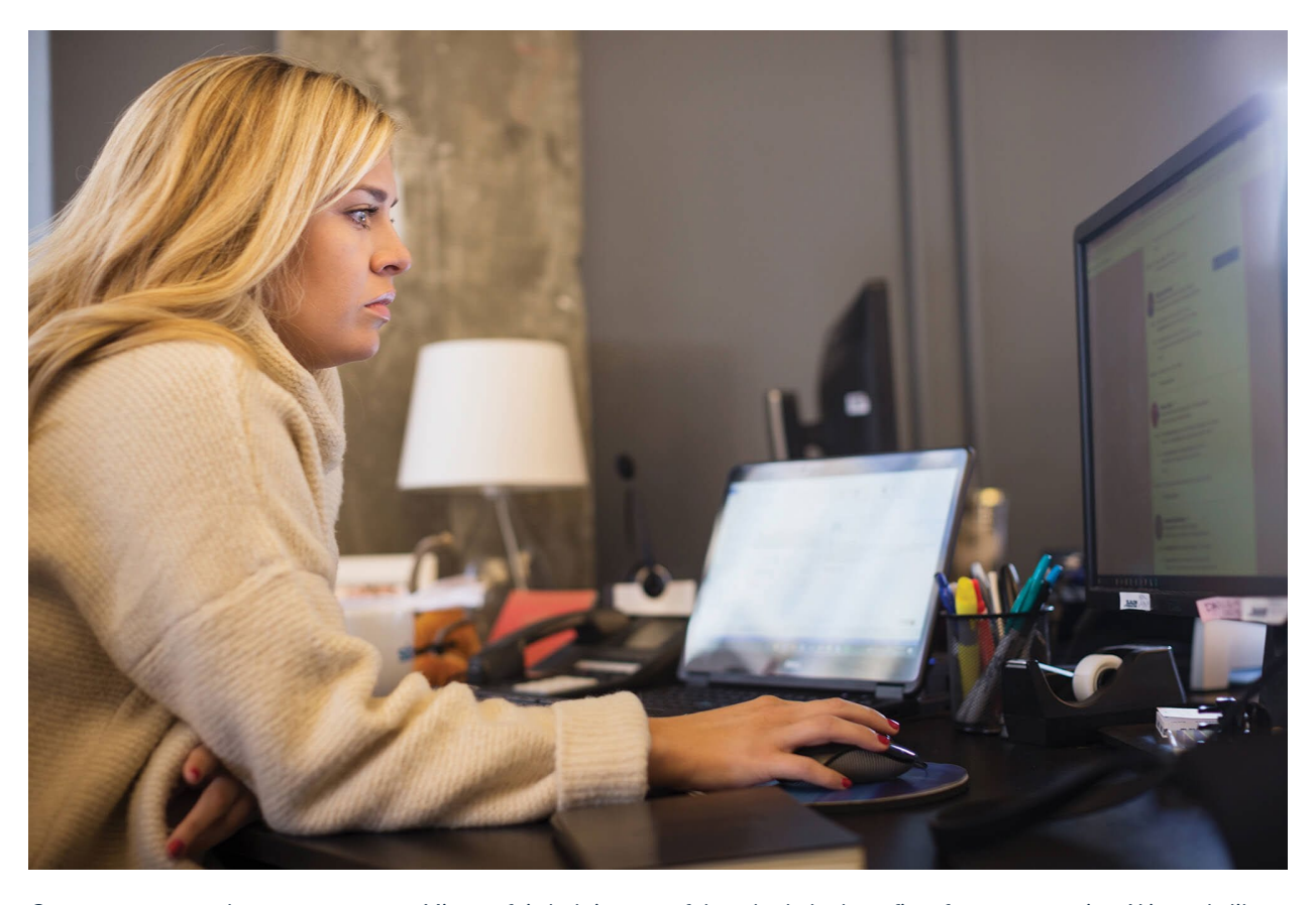
Our smart approach to governance at Microsoft is helping us safely unlock the benefits of next-generation AI in tools like Microsoft 365 Copilot.

Since generative AI exploded onto the scene, it's been unleashing our employees' creativity, unlocking their productivity, and up-leveling their skills.